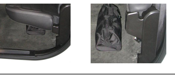
Roadside Package Delivery Instructions

Install under the rear passenger seat. Attach the strap to the seat frame.